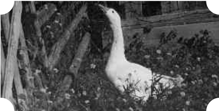
The Wild Goose

All you need is a branch and a bird bath — birds will come. Then I have to chase away the eighteen neighborhood cats. This excites the dogs to a neighborhood choral frenzy. It's best for me not to meddle.